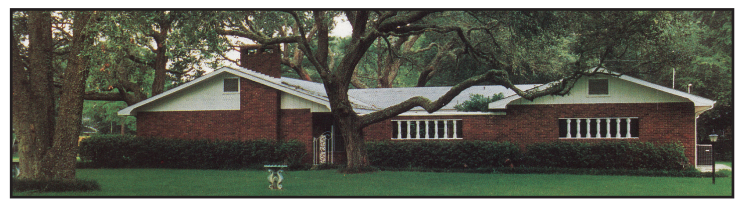
Creative Ministries Cottage – A gift from the Creative Ministries of Presbyterian Women, Women's Ministries, Presbyterian Church, 1997.

For now . . . watch for additional mailings, monitor our website, or call us for updates and progress reports. We are eager to share our enthusiasm with you!