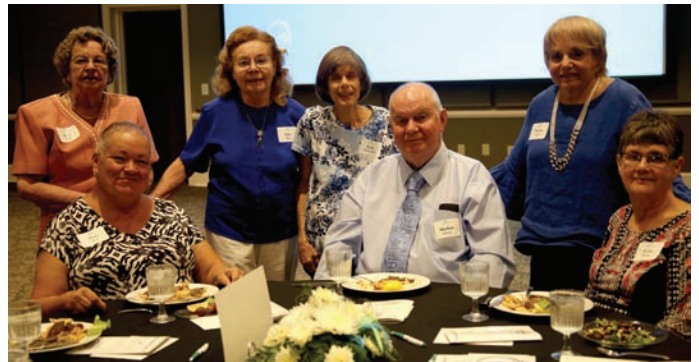
Family and friends of Duvall Homes residents