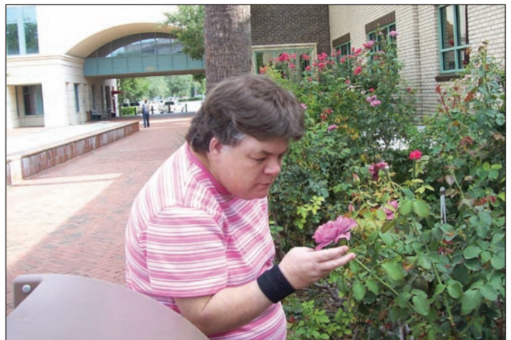
Residents enjoy frequent community outings.