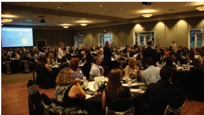
Duvall Homes' Board of Regents are recognized.