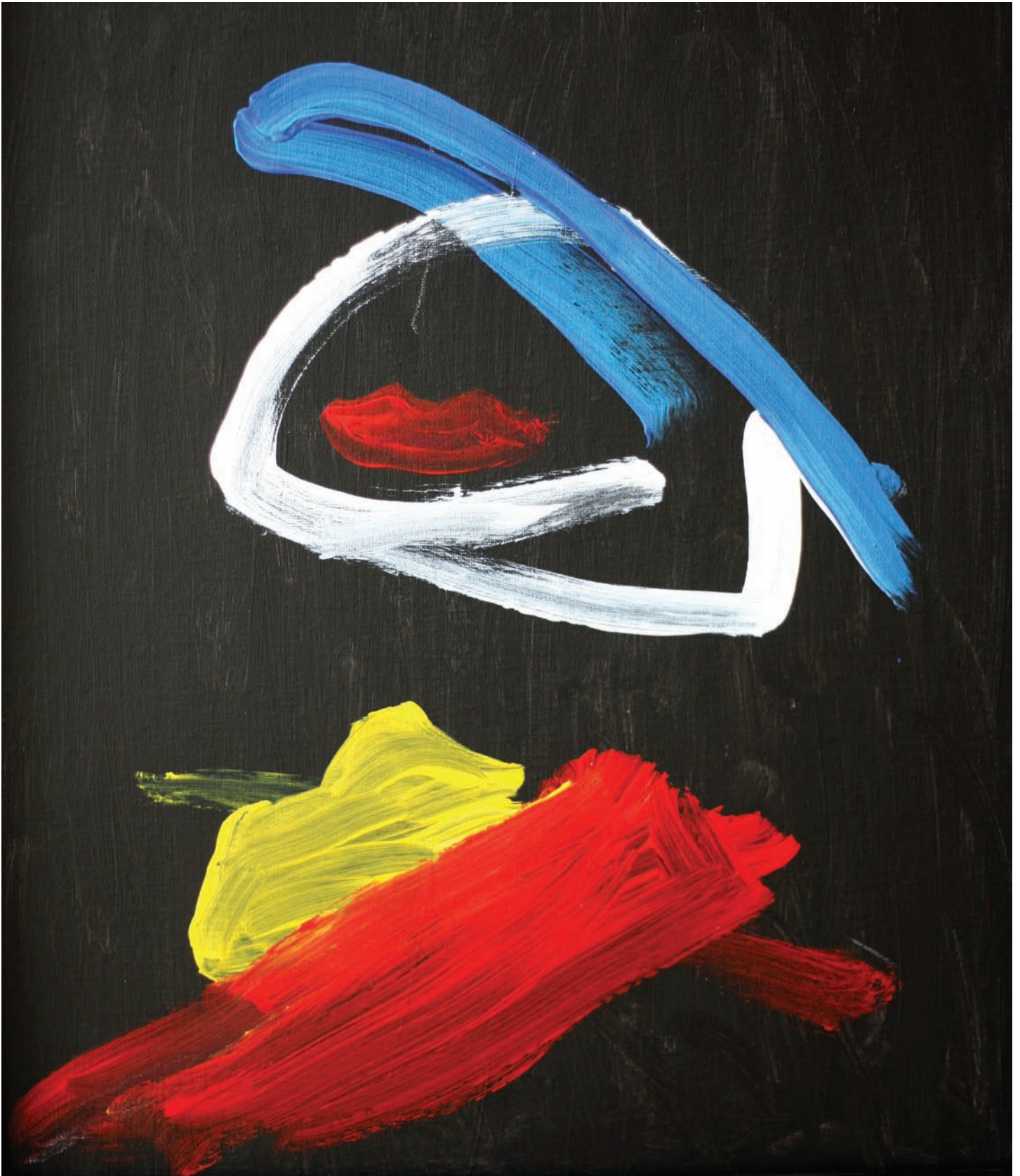
"Woman in Blue Hat" by Samuel Ginsberg, on exhibit with Art . . . For Everyone! at Ormond Beach Memorial Art Museum through January 10, 2016