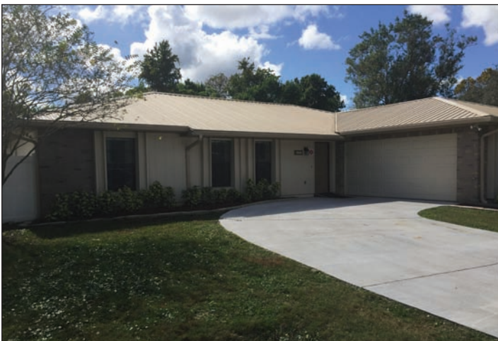
Our latest group home, O’Gorman Cottage.