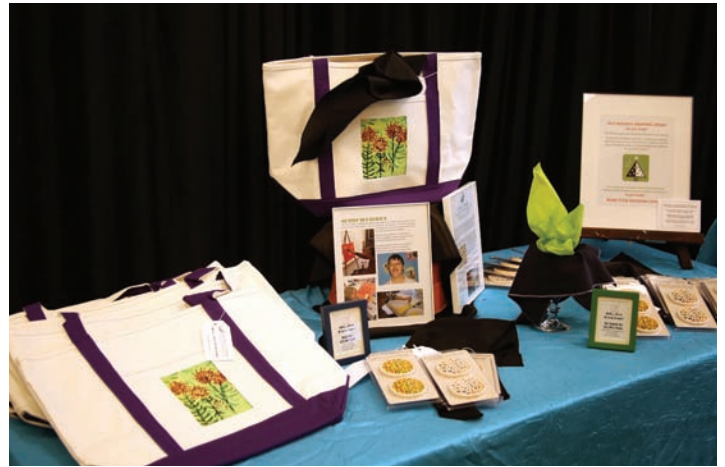
Guests enjoy the Art Gallery and Gift Shop where residents showcased their work.