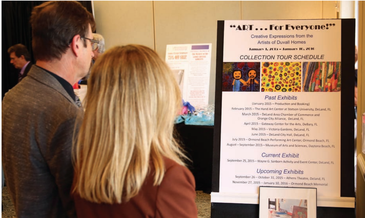
Celebrating creativity at the Next 70 event, guests learn about the successful new art program.

CREATIVE EXPRESSIONS FROM THE ARTISTS OF DUVALL HOMES