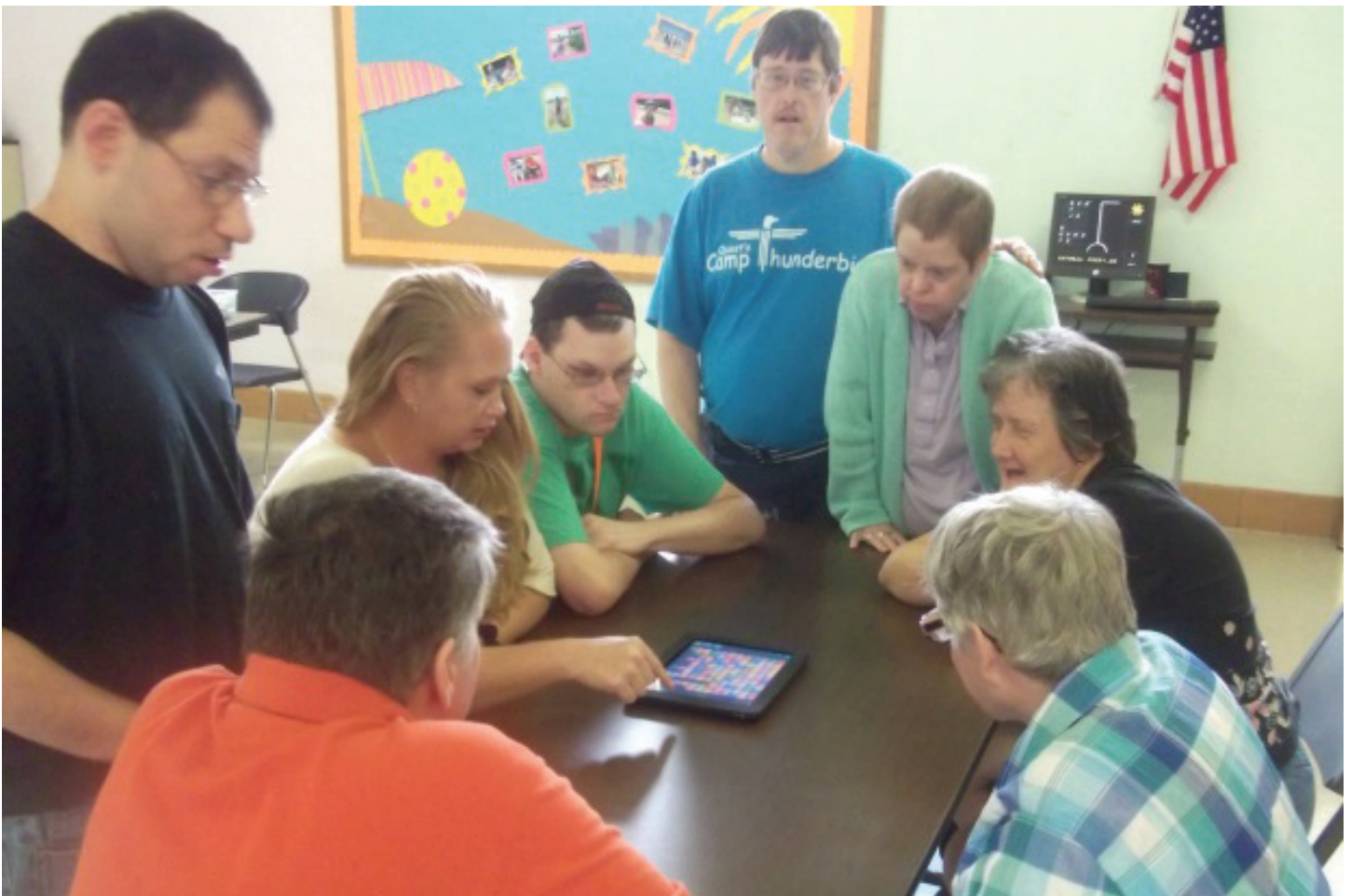
Day Training participants gather for a technology training session.