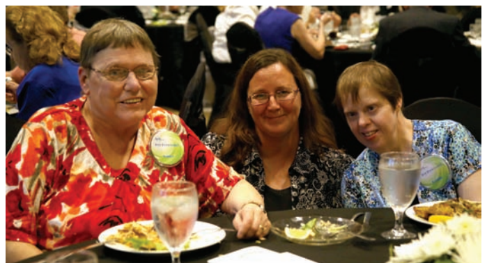
Resident Ambassadors with ADT Director