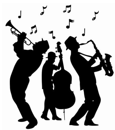
Surprise Musical Guest