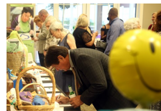
Fun & Inspiration