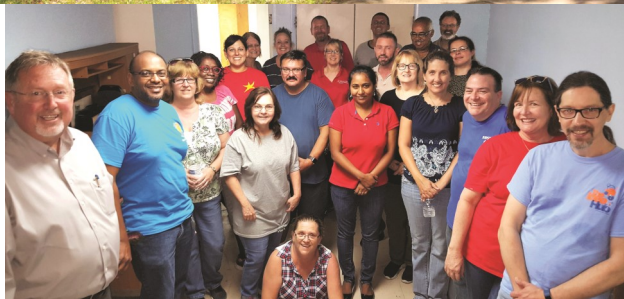
Volunteers from DaVita Labs in 2014 (above) and 2017 (left)